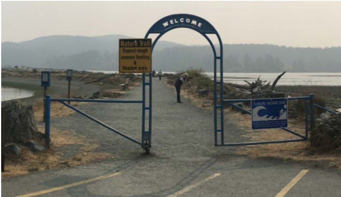
Photo represents the gate to be removed and the existing boulders that mark the edge of the pathway.