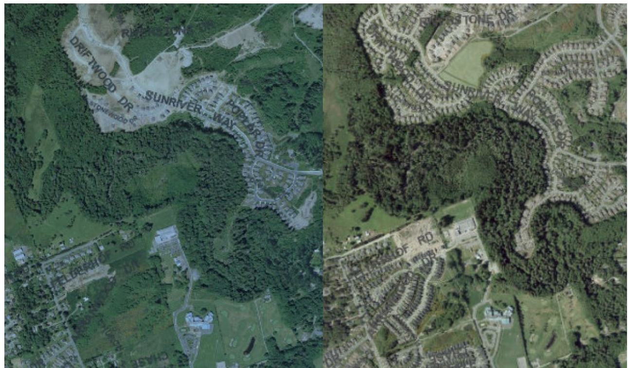
Orthophoto comparison development surrounding Demamiel Creek between 2005 (left), and 2017 (right).

Additional developments outside the District boundary have also increased traffic flow through the already-stressed Highway 14 and Otter Point Road corridors. Over the last 10 years, the public has repeatedly pointed to transportation as a significant problem (Sooke Official Community Plan, 2010 and Sooke Transportation Master Plan, 2009).