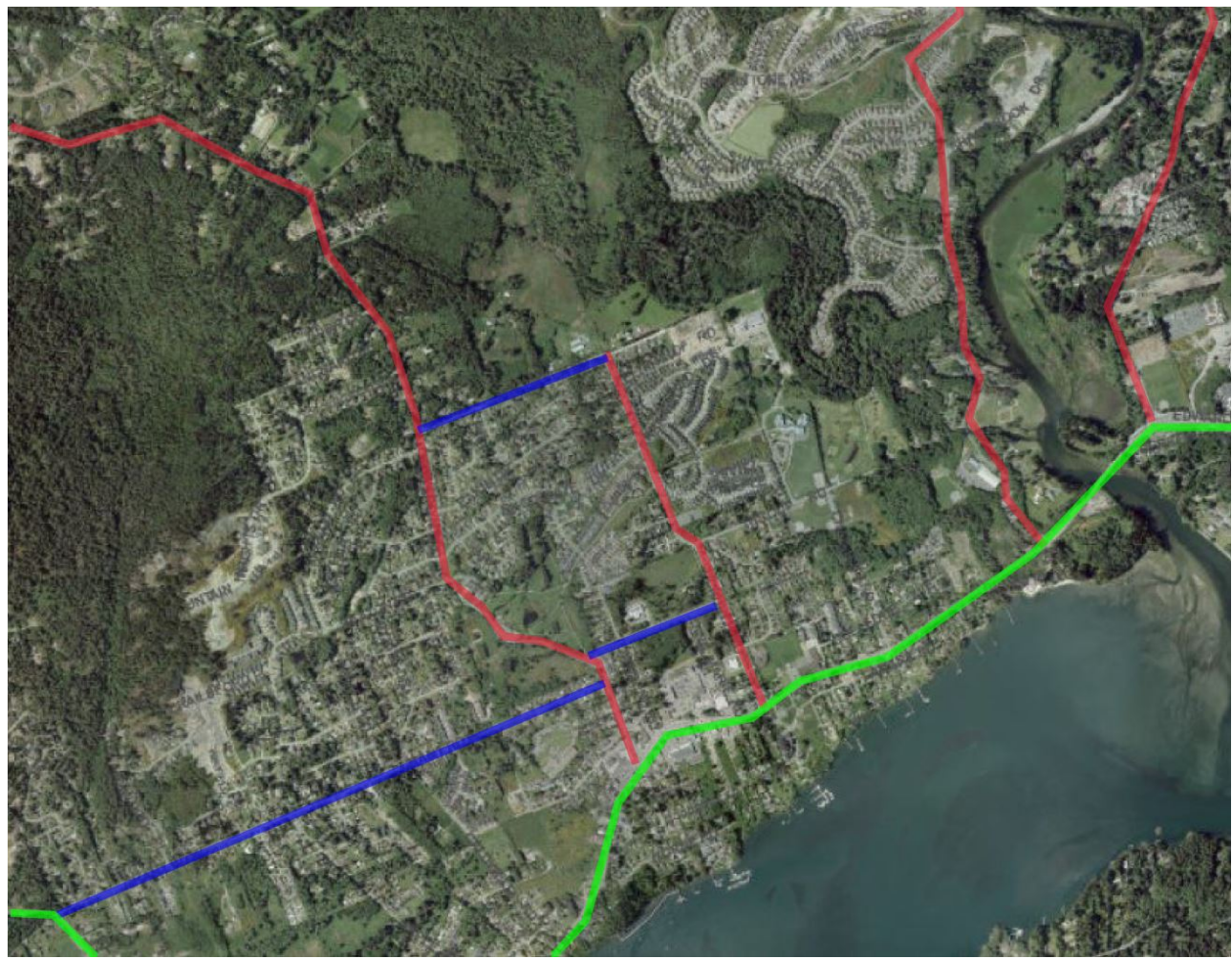
A visual representation of the District's collector/connector road skeleton, with collector roads shown as red, designated cross-connectors shown in blue, and Highway 14 shown in green.

Similar to the road network, the sidewalk network is patchy, owing to the rural roots of the District. Outside of the Town Centre, the majority of the District's sidewalks are developer-built, dedicated as part of suburban subdivisions constructed over the past 15 years. While numerous trail and sidewalk connections exist, there's no overall sense of a cohesive network.